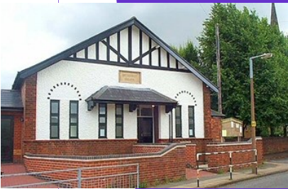
Bramcote Memorial Hall.