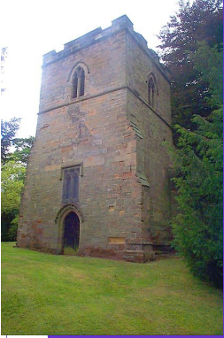
The sunken Church.