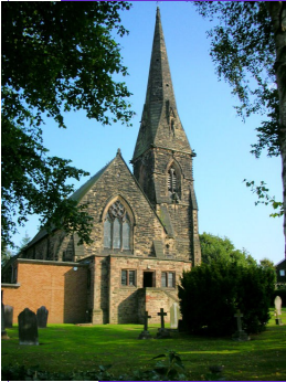
St Michaels Church.